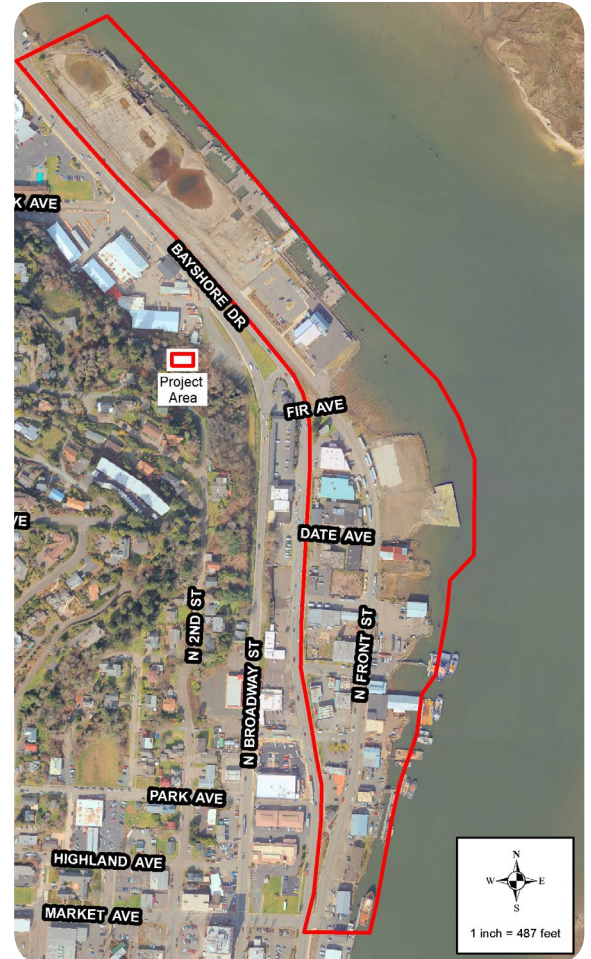
Front Street Blueprint Project Area